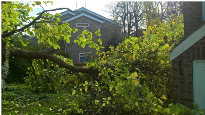
2017 branch failure