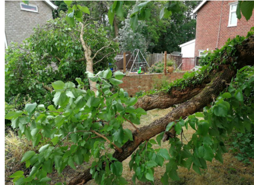
2019 branch failure